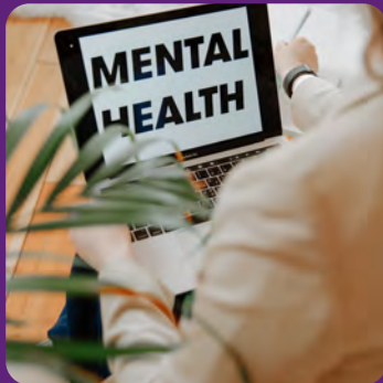
Mental Health printable & apps