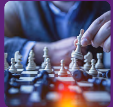
Play board games/puzzles