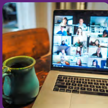
Virtual gatherings with friends