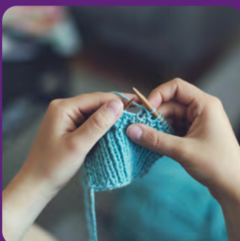
Learn a craft on YouTube – knitting, crocheting, needle felting