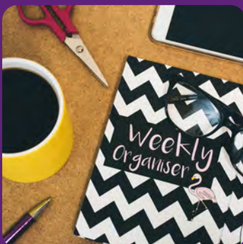
Do jobs you've been meaning to do.