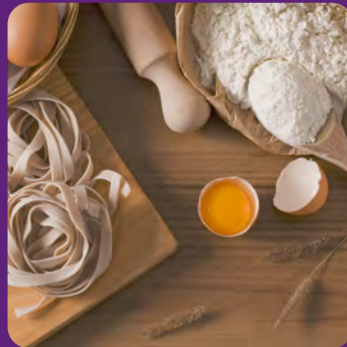
Cook / Bake